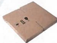
Corrugated cardboard (flattened)