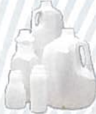
#1 - #7 Plastic bottles (excluding #6) & jugs (caps removed)