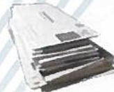
Greeting cards, regular & junk mail