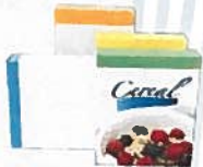
Paperboard boxes (cereal, pasta, tissue etc.)