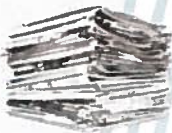
Newspapers, brochures & inserts