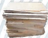
File folders, office paper