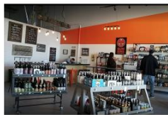
Crafted Bottle Shop Mokena